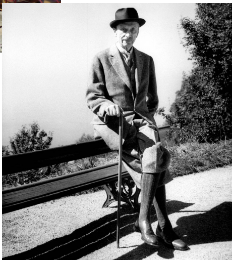
Mannerheim in Montreux