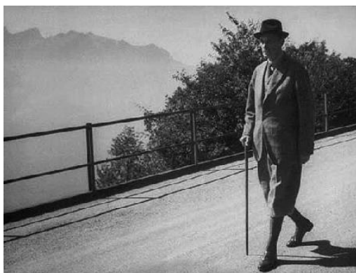
Mannerheim on the road to Valmont