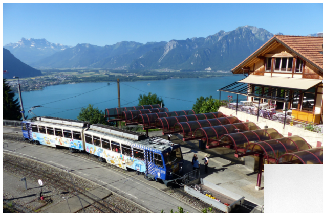
Funicular to Glion station