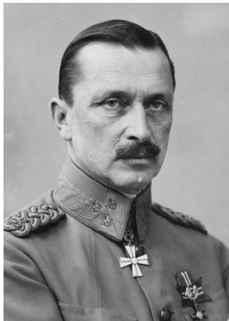
Carl Gustaf Emil Mannerheim

In 1951, on his death, a monument was erected in his honour in Territet.